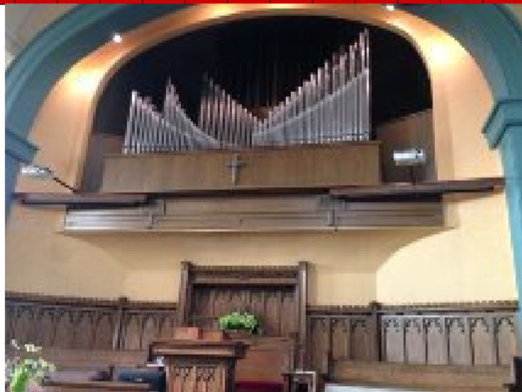
First Baptist Church, Leamington