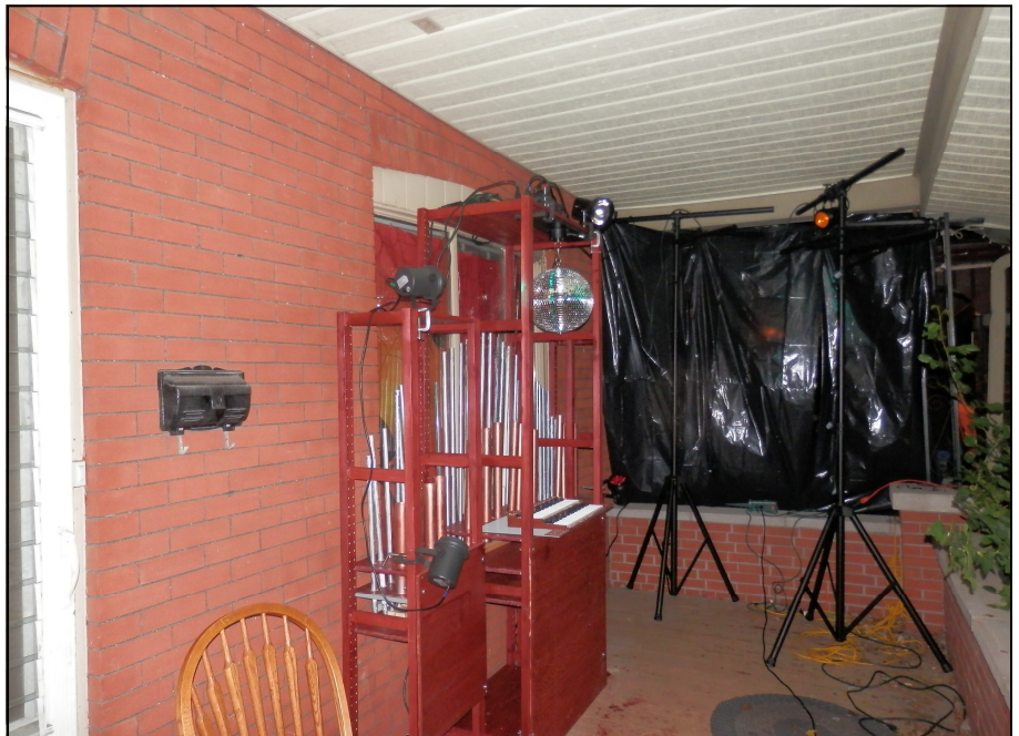
Windsor's only outdoor pipe organ

The Windsor Essex RCCO executive committee embraces the concept of community and will work to create a culture of belonging and inclusion. We welcome your thoughts, ideas and suggestions in this regard and as information about the Membership Enhancement Campaign evolves, we will keep you up-to-date.