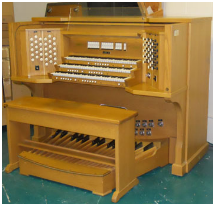
Paulin Memorial's New Organ console to be installed, June, 2014

Paulin Memorial Presbyterian Church will present the beautiful Festival of Lessons and Carols by Jonathan Willcocks on December 7, 2014, 7:00.